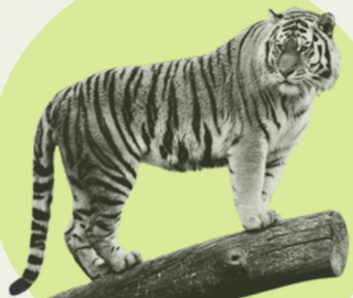
Royal Bengal Tiger